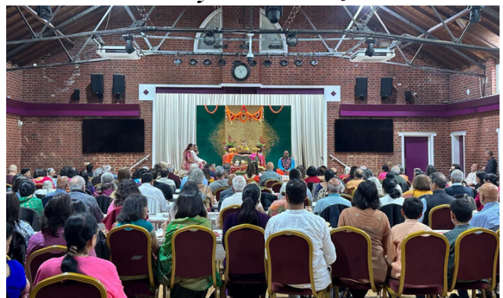
This auspicious day is where prayers are offered to the Goddess Laxshmi.

A community pooja was performed by 106 of our members. A further 100 plus members watched the pooja, and together we invited Goddess Laxshmi to provide us all with prosperity, knowledge and rid us of negativity.